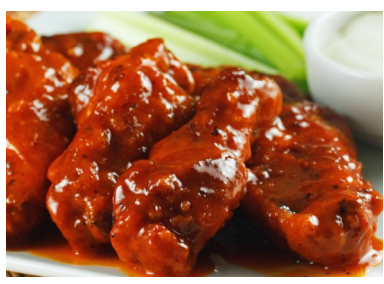
Wet add 50¢ per ten All drums or wings add $1.00 per ten Add Parmesan & Garlic for more Flavor

5 Wings - 6.50 Original or Grilled 10 Wings - 9.95 20 Wings - 18.95 50 Wings - 42.95 (Choice of two sauces on 50 only) Add Celery 75¢ Basket (5) - 8.50 Signature Sauce with Side Item & Dipping Sauce