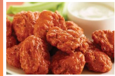
Wet add 50¢ per ten All drums or wings add $1.00 per ten Add Parmesan & Garlic for more

Same Great Taste - No Mess Hand-cut Fresh Chicken Tenders Get'em Grilled for Healthier Option 10 Wings - 8.25 20 Wings - 15.50 50 Wings - 34.95 (Choice of two sauces on 50 only) Basket (10) - 9.50 Signature Sauce with Side Item & Dipping Sauce